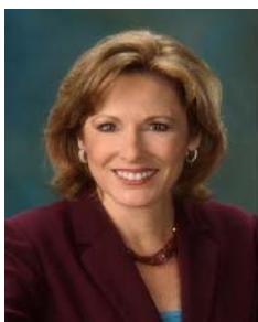
Media Workshop Hits a Homerun

Welcome Friends! The Entrepreneur's Challenges Series WBC to Launch First Step FastTrac® My Business Is Open... Now What? Community Events & News